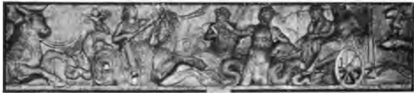
Fig. 40. Marriage of Poseidon and Amphitrite.

Nereus. Ne'reus, the wise and kindly "Old Man of the Sea," lived with his fifty charming daughters below the waters in a great shining cave. He personifies the sea as a source of gain to men, the sea on whose calm and friendly surface merchants and sailors venture out in ships. His fifty daughters, the Ne'reids, represent the sea in all its many phases. They live together happily in their deep-sea cave, but often rise to the surface,